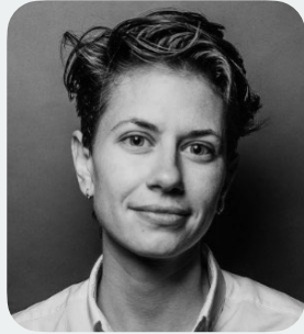
Nicole Myers Product Design Digital, data and analytics product design, and development expertise